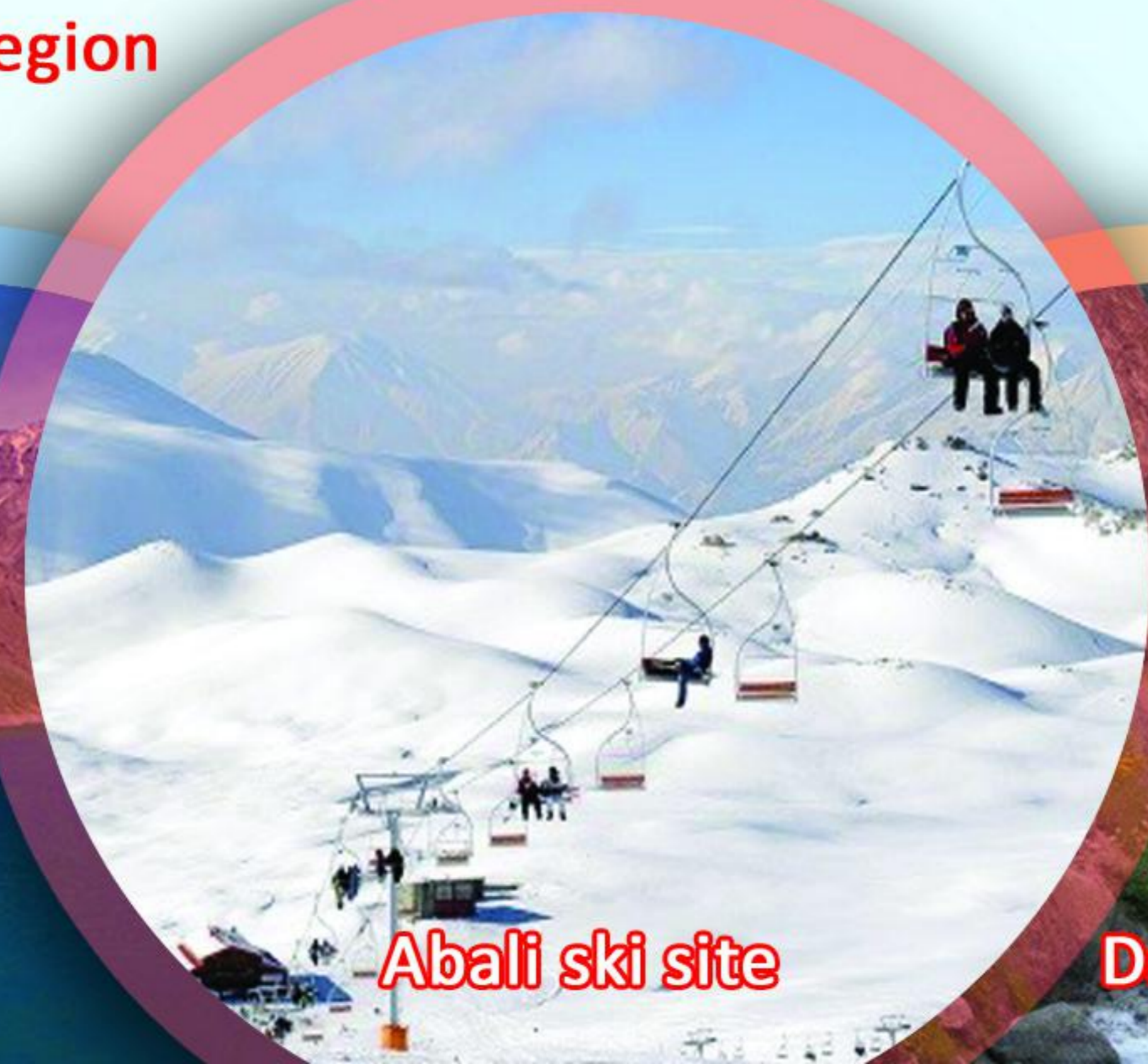
Abali ski site